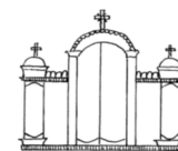
Adoration of the Blessed Sacrament

Eucharistic Adoration usually held on the first Friday. from 10:45 - 11:45 a.m., with Rosary at 10:00 a.m. Next date: June 7